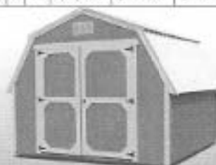
The Original Derksen Barn